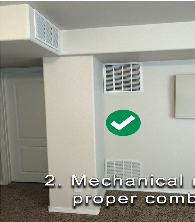
2. Mechanical room must have proper combustion air