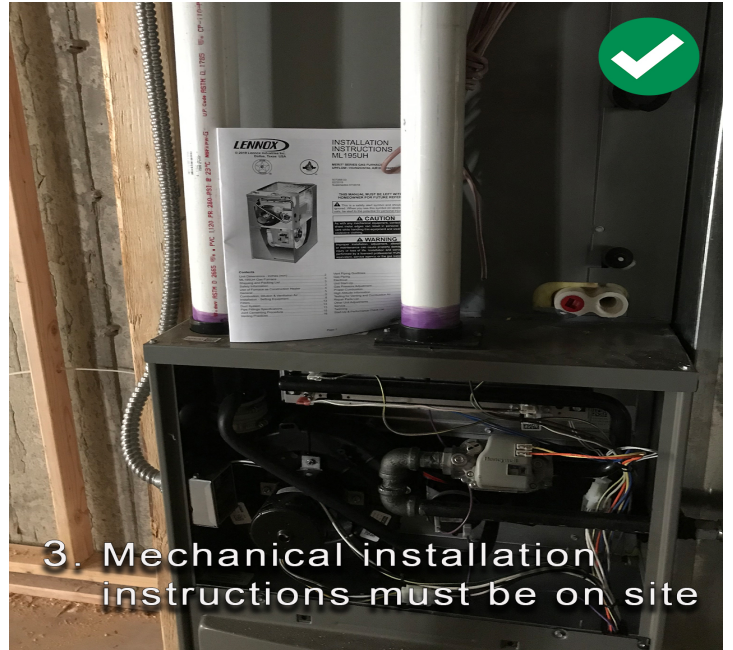
3. Mechanical installation instructions must be on site